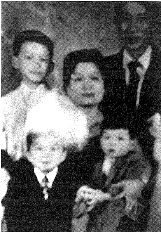
FIGURE 2. My family.

standardised test-driven schooling, the project's instructions, parents' work schedules, separation from home places and kin), picture viewing in dialogue with different audiences, conventions and ideologies (e.g. schooling expectations, youth media and consumption culture, discourses of race/ethnicity, family unity and harmony), and picture content of what is made visible about social positioning and placement (e.g. choreography of care work). These three 'sites' of meaning-making have often been pulled apart, as Gillian Rose writes (2001, 16). But in practice, these are not discrete but part of a whole. And meanings are made and remade as the child uses his/her photography and photographs for self- and identity-making purposes – to communicate across and about social distinctions and cultural differences; to express love, connection and solidarity; to show pride and self regard; to seek and express aesthetic pleasure; to defend against negative judgement. Children's picture use must also be understood to be in dialogue with or in conflict with, if not to be refocusing on, larger social forces, including immigration and immigration policy, welfare reform and work-first mandates, excessive wage-work demands,